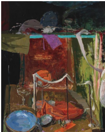
Laura Smith The March of the Wands , 2021 Oil on linen 32 x 26 81.3 x 66