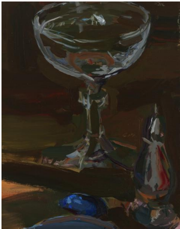
Laura Smith Ace of Cups , 2021 Oil on board 10 x 8 25.4 x 20.3