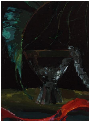
Laura Smith Rolling Treasures , 2021 Oil on board 8 x 6 20.3 x 15.2