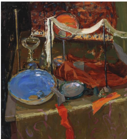
Laura Smith The Feast Day of Saint Roch , 2021 Oil on linen 26 x 24 66 x 61