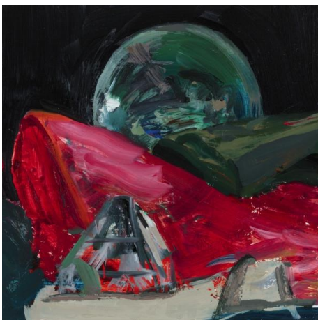
Laura Smith Lightworker , 2021 Oil on board 8 x 8 20.3 x 20.3