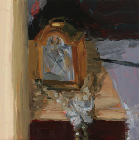
Laura Smith In the Wings , 2021 Oil on board 8 x 8 20.3 x 20.3