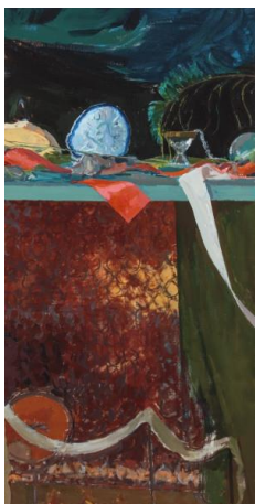
Laura Smith Theatre Royal , 2021 Oil on linen 40 x 20 101.6 x 50.8