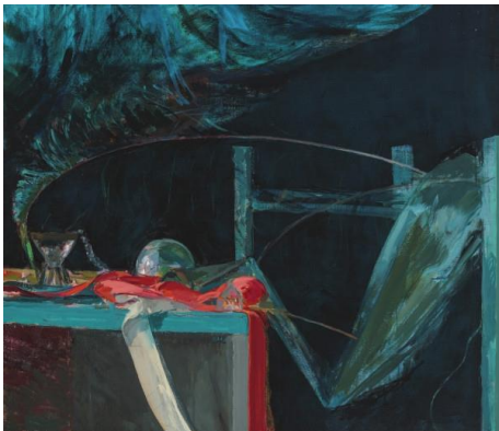
Laura Smith Glimmering Mismatch , 2021 Oil on linen 24 x 28 60.9 x 71.1