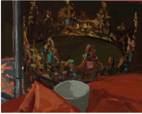
Laura Smith In amongst Diamonds , 2021 Oil on board 8 x 10 20.3 x 25.4