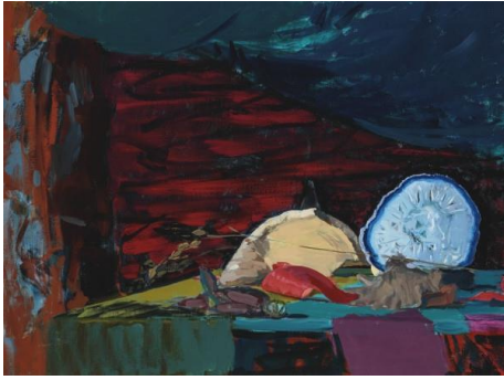
Laura Smith A Big Sigh of Relief , 2021 Oil on linen 24 x 32 61 x 81.3