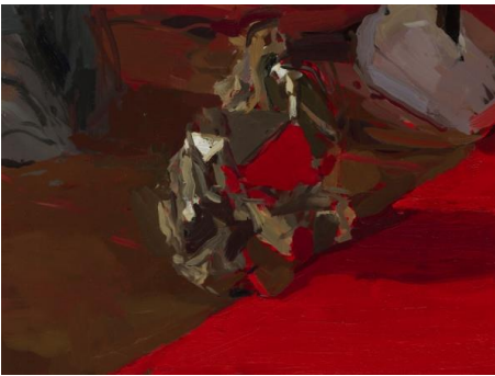
Laura Smith Powering Pyrite , 2021 Oil on board 6 x 8 15.2 x 20.3