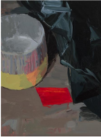
Laura Smith Pointed Toe , 2021 Oil on board 8 x 6 20.3 x 15.2