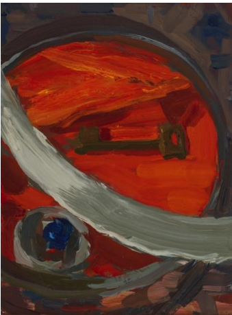
Laura Smith A Kind of Answer , 2021 Oil on board 8 x 6 20.3 x 15.2