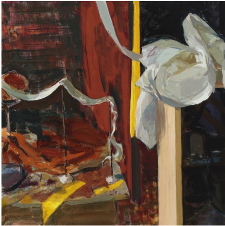
Laura Smith Cupped Hands , 2021 Oil on linen 28 x 28 71.1 x 71.1