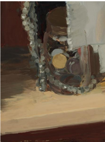
Laura Smith Queen of Pentacles , 2021 Oil on board 8 x 6 20.3 x 15.2