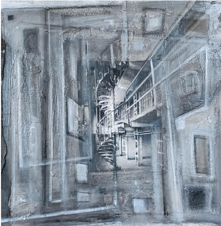
Daniela Gullotta, Alcatraz, 2019, Mixed media on wood, 60 x 60 cm, £4,250.

The works in Presence and Absence are filled with the quality of entropic romance that characterises Gullotta's art. Each image is suffused with the poetry of memory, with the trace of those past, and with the expectation of those to come. Through the physical absence of people and the eternal presence of history in these works, Gullotta hints at the passage of time on both a majestic and everyday level.